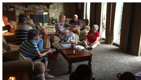
The Rote's visit to Fairmont