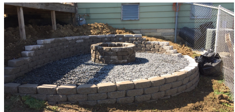
The fire pit we built in our yard