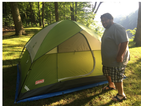
Our first camping excursion together